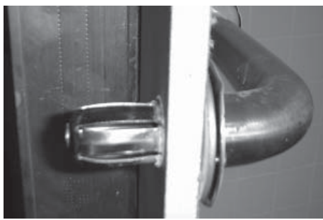
Picture Above Shows the WingIt™ as it would look inserted into the wall.